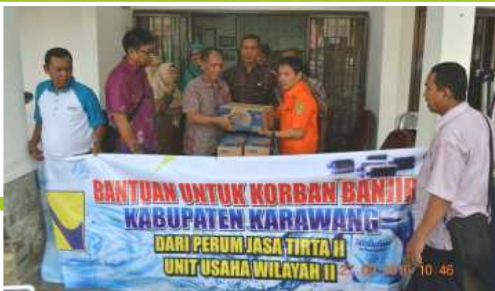
PJT II Serahkan Bantuan Untuk Korban Banjir Karawang