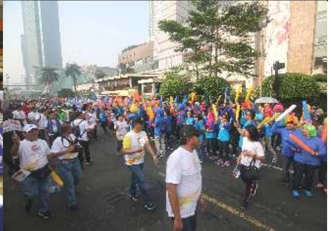
Pekan Olah Raga dan Seni (PORSENI) BUMN Tahun 2016