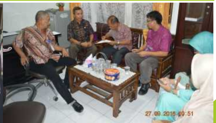
PJT II Delivered the Assistance for Flood Victims in Karawang Regency

Jumat, 18 November 2016, Perum Jasa Tirta II melalui Unit Usaha Wilayah II menyerahkan bantuan untuk korban banjir di Kantor BPBD Kabupaten Karawang. Bantuan ini diharapkan dapat bermanfaat bagi korban bencana alam banjir di Kabupaten Karawang.