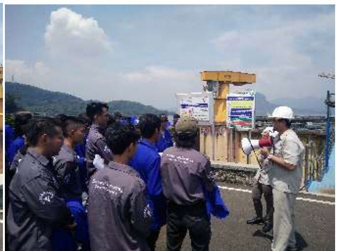
Field Study Visits of Brawijaya University and Pertamina University

Untuk mempelajari sistem kerja pembangkit listrik PLTA Ir. H. Djuanda dan sistem kerja Bendungan Ir. H. Djuanda yang dikelola oleh Perum Jasa Tirta II, Rabu, 19 April 2017, Perum Jasa Tirta II menerima kunjungan dari Fakultas Teknik Universitas Brawijaya Malang dan Fakultas Teknik Universitas Pertamina.