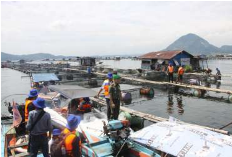
Operasi Jatiluhur Bersih

Setelah ditandatanganinya MoU tentang penertiban Keramba Jaring Apung (KJA) di Bale Nagri pada bulan Maret 2017, Perum Jasa Tirta II dan Pemerintah Kabupaten Purwakarta mulai direalisasikan penertiban KJA sebagai tindak lanjut komitmen tersebut pada hari Senin, 3 April 2017.