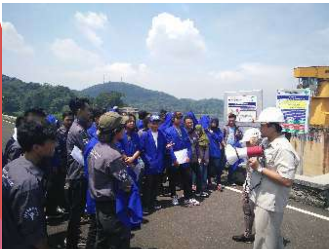
Kunjungan Studi Lapangan Universitas Brawijaya dan Universitas Pertamina

Untuk mempelajari sistem kerja pembangkit listrik PLTA Ir. H. Djuanda dan sistem kerja Bendungan Ir. H. Djuanda yang dikelola oleh Perum Jasa Tirta II, Rabu, 19 April 2017, Perum Jasa Tirta II menerima kunjungan dari Fakultas Teknik Universitas Brawijaya Malang dan Fakultas Teknik Universitas Pertamina.