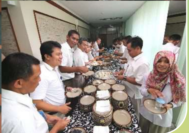
Perum Jasa Tirta II Held Halal Bihalal Eid Al-Fitr 1438 H

S enin (03/07/2017), Perum Jasa Tirta II gelar acara Halal Bihalal dalam rangka silaturahmi setelah cuti bersama Idul Fitri 1438 H di Graha Citarum, Kantor Pusat PJT II.