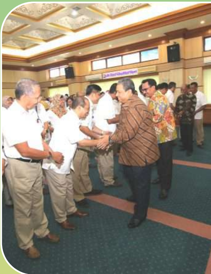
Perum Jasa Tirta II Gelar Halal Bihalal Idul Fitri 1438 H