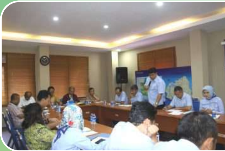
Kunjungan Kerja Dewan Pengawas ke Unit Usaha Wilayah IV