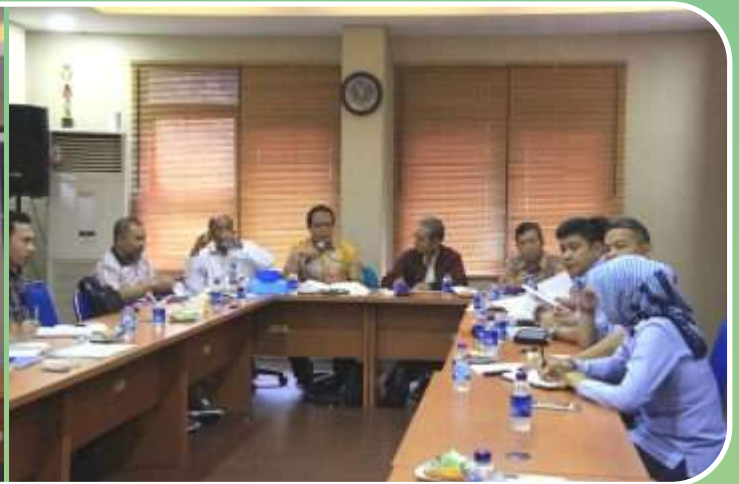
Working Visits of Supervisory Board of PJT II to the Business Unit IV